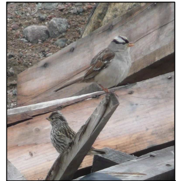
Adult and fledgling White Crowned Sparrows